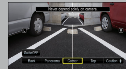
Multi-view: split screen for left and right rear view

You have a choice of four viewing modes. Multi-view splits the screen so you have a clearer view of both left and right behind the car. Top view is convenient when hooking up to a trailer, whereas Panorama gives you a very broad view of your surroundings. Also, whilst in special viewing modes you have a picture-in-picture function showing a small rear view.