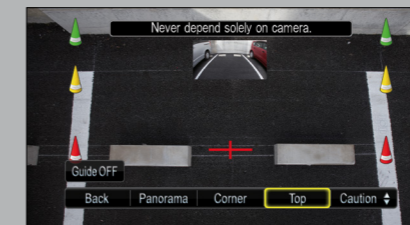
Top view: convenient for precise reversing