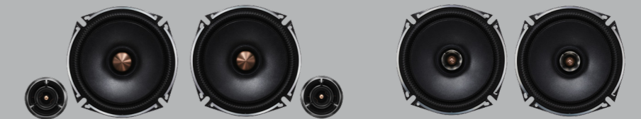
DDLInear Component Speaker: DDL-R170S

These audiophile speakers are equipped with Alpine's exclusive DDLInear technology for unparalleled sound clarity. They employ a dual emission tweeter for superbly detailed high frequencies and an advanced multi-layer fibre cone that delivers faithful reproduction and stunning sound quality.